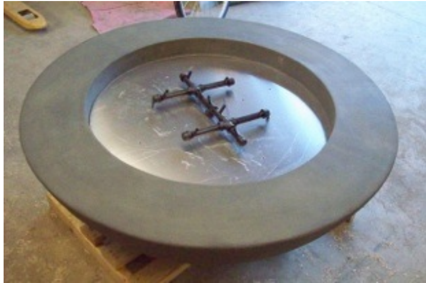
Figure 2 Cross Fire Burner (bowls are different)

FOR automatic ignition run 110V to the location of the bowl next to the gas line.