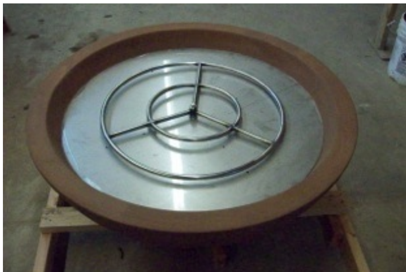
Figure 1 Stainless Steel Ring ~

The photos below demonstrate how pan and ring or cross fire burner should sit in the bowl.